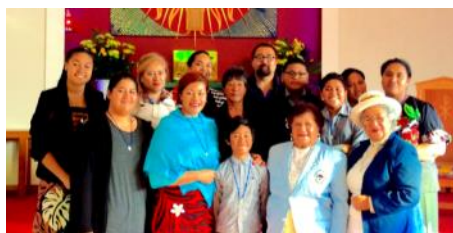
Lay Marists make commitments, Otara, Auckland. May 2016