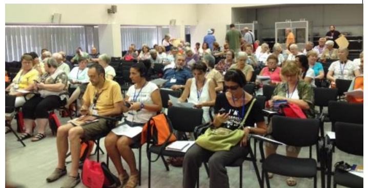
Participants at the Los Negrales Conference

We have planned a meeting in Europe for February on the theme “How can we promote Marist Laity and our common mission following on from the Los Negrales conference?” Let’s give ourselves a deadline