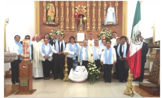
Marist Laity of the Parish of San Bernardino, Toluca,

That same day, the Centro de Proyección Universitaria (CPU), the University Parish, celebrated its patronal saint, many members shared their talents as well as training and food; The party included Priests, SM Brothers and Laity.