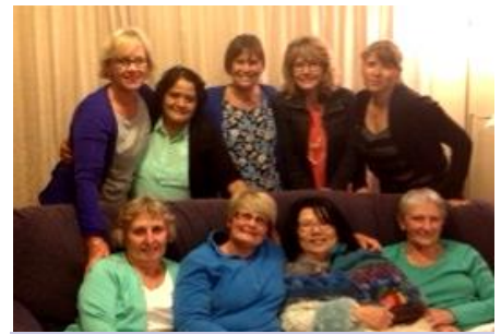
Marian Mothers, Henderson November 2015