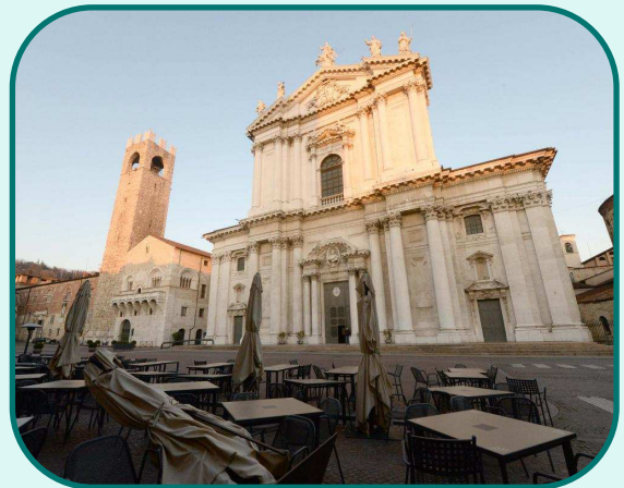
The desert square in front of the duomo of Brescia