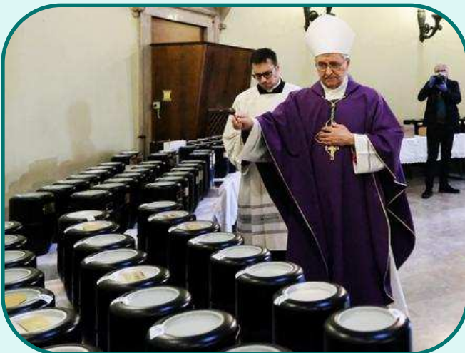
The bishop of Brescia blessing 300 urns